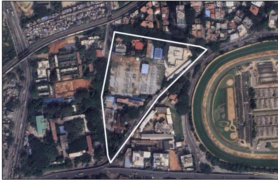
Figure 1: Satellite view of AR Circle Substation

Presently, the AR circle substation premises is spread across ~10 acres of land under KPTCL ownership. The site has existing built up area of ~464581 sqft. Site area available for construction of real estate is ~ 3.5 acres marked in black boundary in Figure 2.